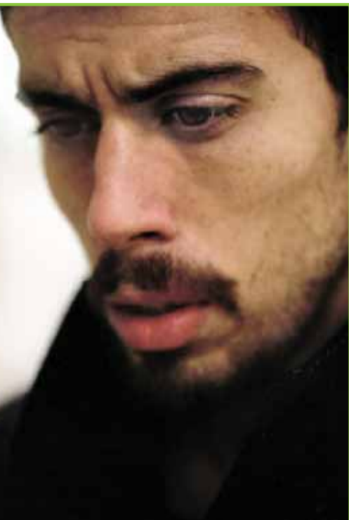
Godfrey Toby Kebbell Dominic Cooper Orlando Bloom